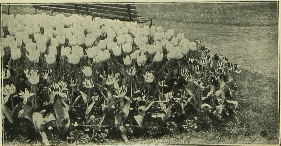
A Bed of Tulips

These belong to the late or May-flowering Tulips, and have immense, attractive flowers of singularly picturesque form and brilliant and varied colors. The petals are curiously fringed or cut, and the form of the flower, especially before it opens, resembles the neck of a parrot. In splendid mixture, 15 cts. per doz., 85 cts. per 100.